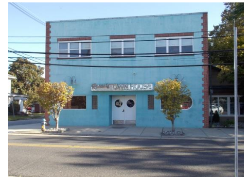
Rocco's Town House